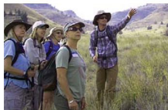
Top: Cliff dwellings overlooking the San Juan River in Utah. Right: A Broad walks through John Day Fossil Beds National Monument in north central, Oregon. Above: Broadwalkers in Spring Basin, Oregon.