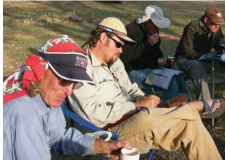
BHLF monitors prepare for a day of work at Indian Creek, Utah.