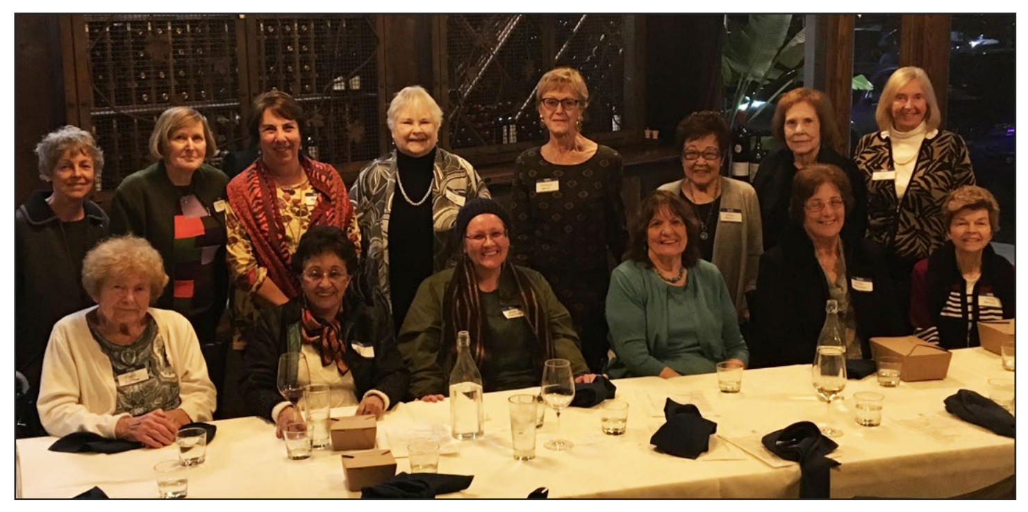
The women of Neighborhood 10 of the Mid-Peninsula branch enjoyed their holiday luncheon in January (after the Triad deadline) so here they are, with their holiday smiles, looking ahead to a healthy, wealthy and wise 2020!