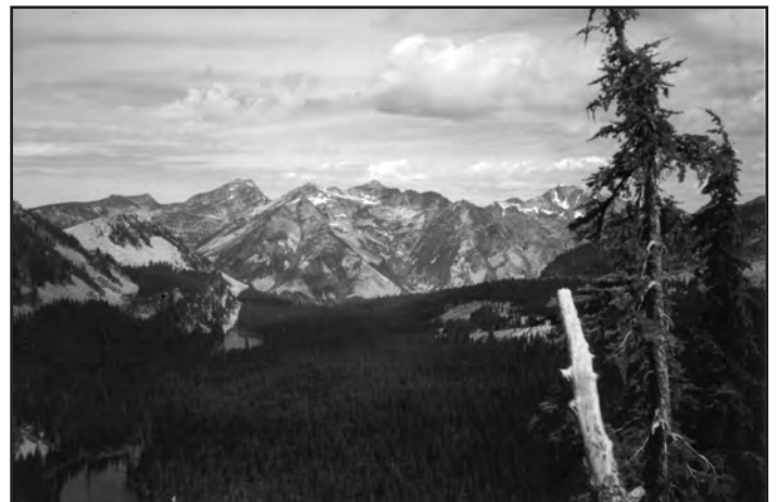
The site of the proposed Rock Creek Mine as it backs up to the Cabinet Mountains Wilderness.

Two recent Broadwalks to areas on both sides of the Cabinet Mountains