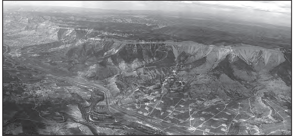
Colorado's Roan Plateau.

Baucus, a long-time critic of the fees, said the current system amounts to double taxation. "Americans already pay to use their public lands on April