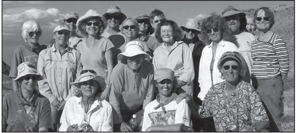
Broadwalkers gather after a hike into Broad Canyon near Las Cruces, NM - October 2007.

With the help of The Doña Ana County Wilderness Coalition, 28 Broads learned about the ecology, politics, and natural history of southern New Mexico while camping in the shadow of the Organ Mountains. The Broadwalk was aimed at calling attention to the coalition's Proposed Wilderness and National Conservation Area. The Proposal calls for the designation of wilderness in Broad Canyon and the East Potrillo Mountains as well as in the eight existing Wilderness Study Areas in the county. It also proposes the establishment of a National Conservation Area that protects the