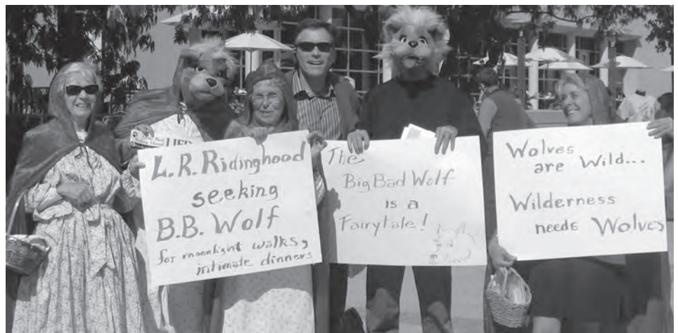
Broads as Little Red Ridinghood, BB Wolf, and a bevy of Grannies make an appearance at the University of New Mexico campus in Albuquerque during Wolf Awareness Days in October.

Needless to say, the potential for these corridors to negatively affect watersheds, wildlife habitat, recreational opportunities, scenic and historic values and much more, is huge. In addition, these corridors will