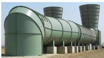
Example of a mine ventilator