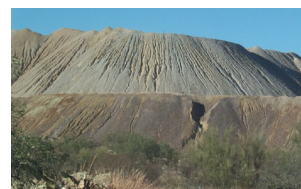
Example of a waste pile