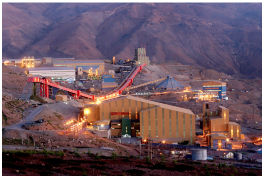
Example of a processing facility