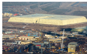
Example of a sulfur pile