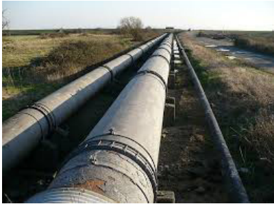
Example of a slurry pipeline

“Mining by its nature and scale causes significant changes in the landscape and ecosystem” (Mining Minnesota/Global Minerals Engineering PP)