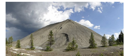
Example of a tailings pile