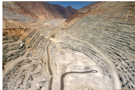
<< Example of an open pit mine