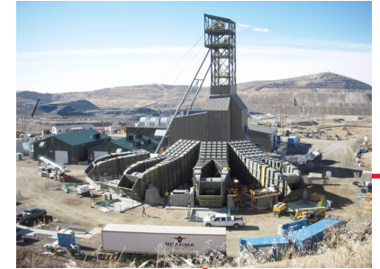
>> Example of a mine ventilation facility for underground mines