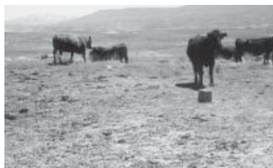
This new bill offers new hope that one day our public lands won't look like this!

If all federal grazing permittees availed themselves of the buyout offer, the plan would effectively retire a federal welfare program that costs American taxpayers more than $500 million annually in subsidies for public lands ranching operations. A