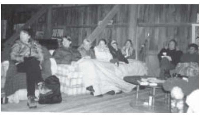
Broads gathered in the barn, snuggled under blankets ready to listen to an evening of great speakers.

introduced us to the concept of "restoring wilderness," as many of the areas in the proposed wilderness additions for Vermont had been intensively logged, but the land is