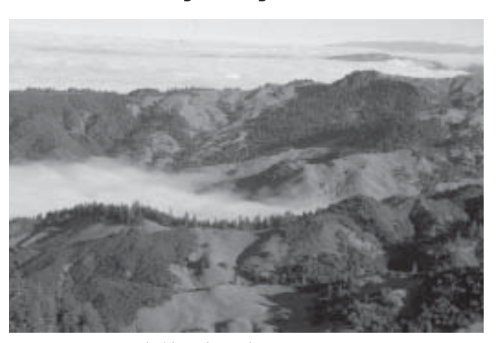
King Range in Humboldt and Mendocino County.

The legislation has received unprecedented bipartisan support from