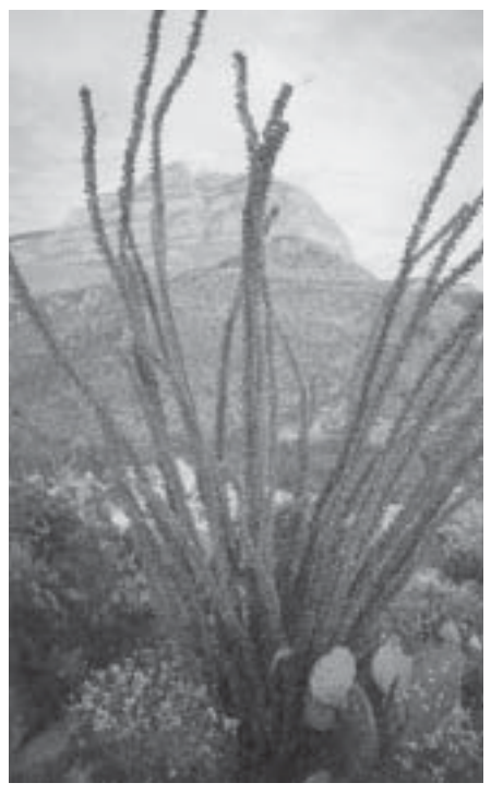
Worth protecting? Photo taken at the Otero Mesa Broadwalk, 2000.

Otero Mesa remains some of the finest remnant Chihuahan Desert grassland in the state and many threatened or endangered species such as Baird's Sparrow, Lark Bunting, Cassin's Sparrow and Burrowing Owls are drawn to this remote grassland. This area is also home to one of the states most genetically pure herds of pronghorn.