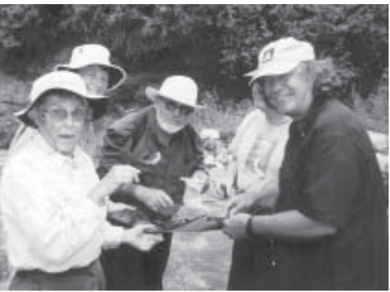
Broads find out what to look for in a healthy desert

The Yaak Valley, Montana's only rain forest, will captivate you with its logging-scarred, but unique and haunting landscape, which is threatened