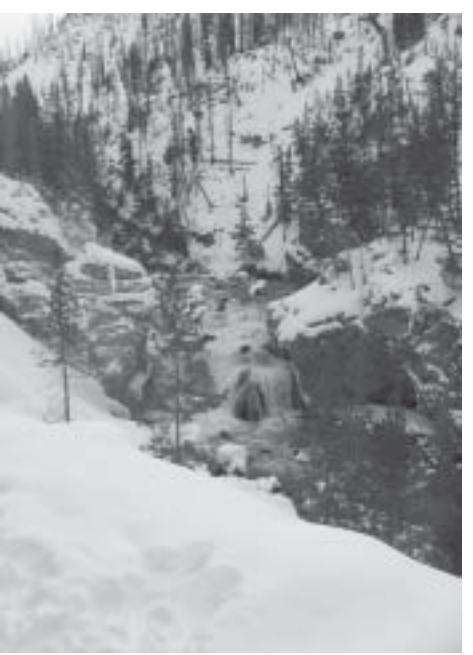
Firehole River.

Yellowstone in winter is an experience I will never forget. I hope I can come back another winter and perhaps enjoy it without the whine of snowmobiles in the background.