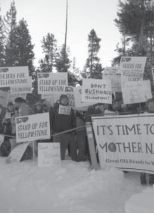
Broads protest snowmobiles in Yellowstone.

was a brisk -14 degrees with blue skies except for downtown West Yellowstone, where herds of snowmobiles sliding out of their barns created a blue haze that held in the