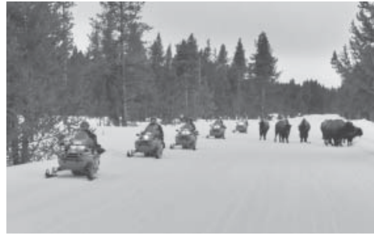
Bison step aside as snowmobiles pass.

Industry Association show there are 14.9 million crosscountry skiers in the United States, 5.4 million snowshoers and only 1.6 registered