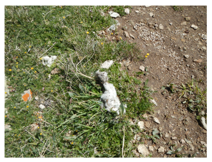
Goat wool adjacent to edge of wallow

This appendix includes sample photos from the Mount Mellenthin area indicative of a level 2 rating, or 'a significant change from pristine' (each photograph was georeferenced and associated with a dated survey site form [see Appendix 1 for more details on condition classes]).