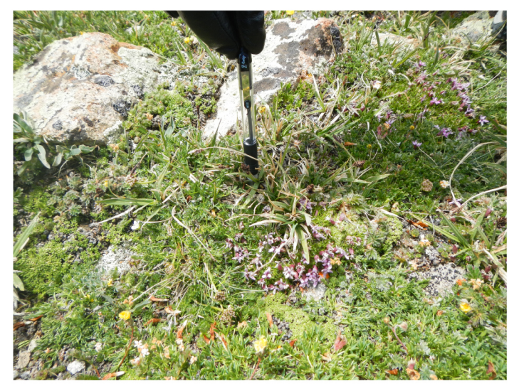
Uniformly grazed special status plant Cymopteris bakeri (note yellow flower next to pen) and Androsace chamaejasme adjacent to grazed plant