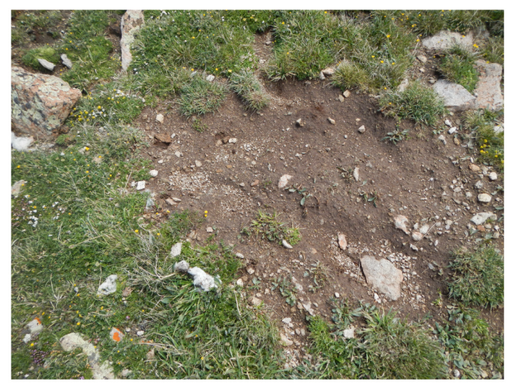
Wallow site and goat wool in the midst of special status plants Androsace chamaejasme and Cymopteris bakeri