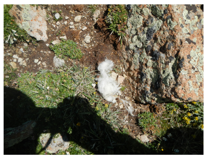
Goat wool next to Androsace chamaejasme and turned over soil