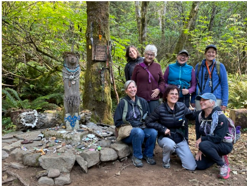
Broads hiking the Amanda Trail, one of the many hikes near the Canal Creek Group campsite.

We have reserved the Canal Creek group campsite (both areas described below) in the Siuslaw National Forest near Waldport for Tuesday, August 1 - Thursday, August 3. This large, beautiful, secluded space bordered by lovely Canal Creek, will be all ours for 2 nights. Cost will be campsite fees divided by number of participants.