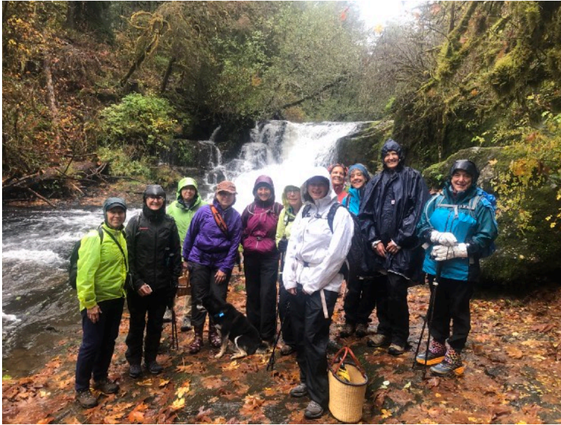
An October Alesa Falls hike in 2021

Join us for this fun fall hike where we hope to see mushrooms, fall colors and spawning salmon but we're sure to have fun and see two waterfalls. This is a little over 4 mile out and back fairly easy hike. We'll meet at the trailhead at 10 and plan carpools