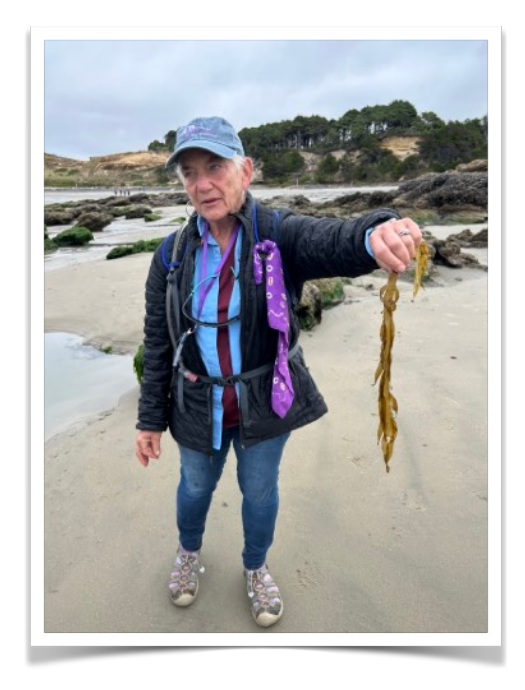
The secret ingredient to my best homemade sushi