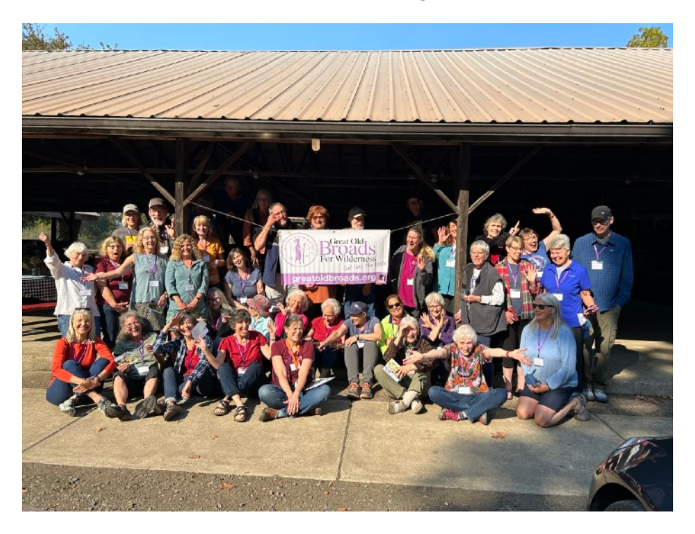
Please join us on October 1st in Brownsville!