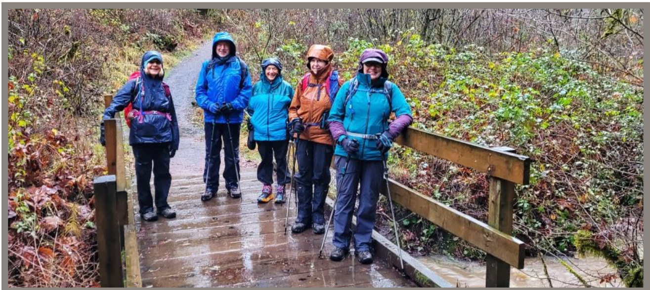
Great Old Broads and Bros enjoy McDonald Forest, rain or shine.

Among the recreationists who regularly enjoy McDonald and Dunn research forests are members of a nationwide, grassroots organization of women dedicated to the preservation of America's wild places.