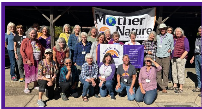
We gathered in October. It's time to gather again!

Please sign up HERE if you plan to attend.