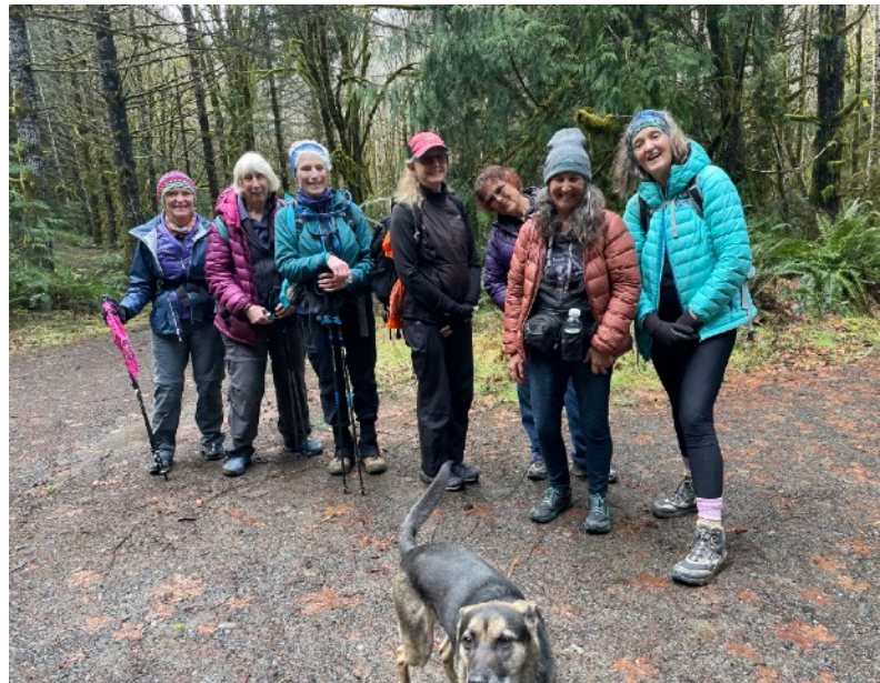
The February hikers